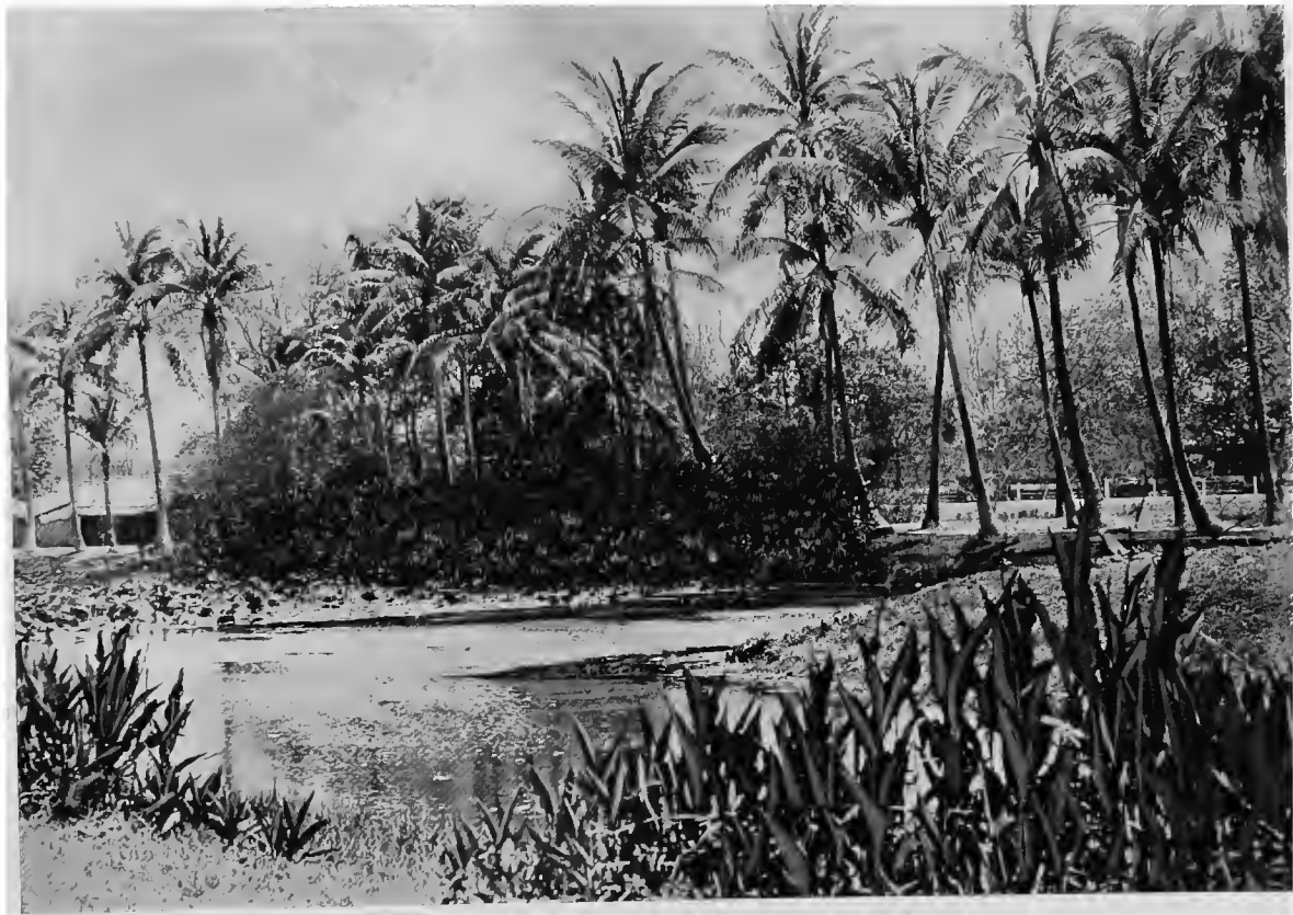
Cocoa Nut Palms and Eastern Foliage